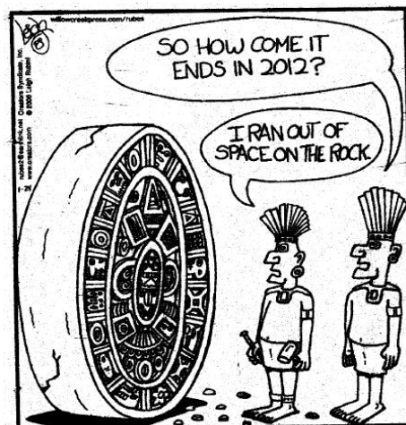
At last the mystery of the Mayan Calendar is revealed!

-to-be-ready-for-Jesus" list today. Who knows; the Mayans might be Right —or worse, they might be wrong; He might come today!